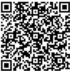
QR Code for online submissions